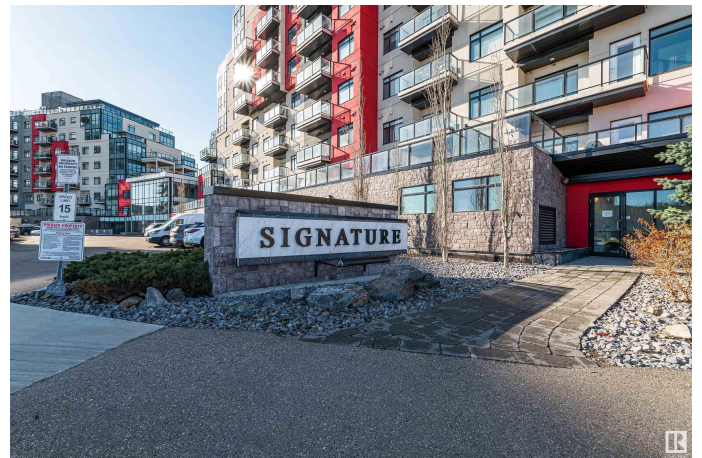
813-5151 Windermere Blvd SW, Edmonton, AB