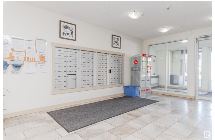
223-5816 Mullen Pl NW, Edmonton, AB