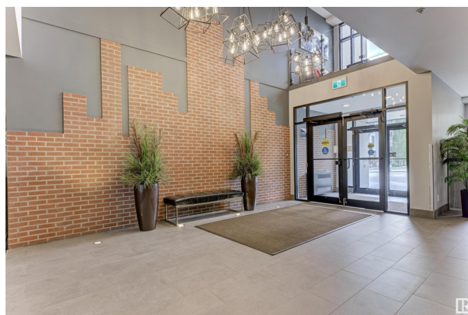
1154 Adamson Dr SW, Edmonton, AB