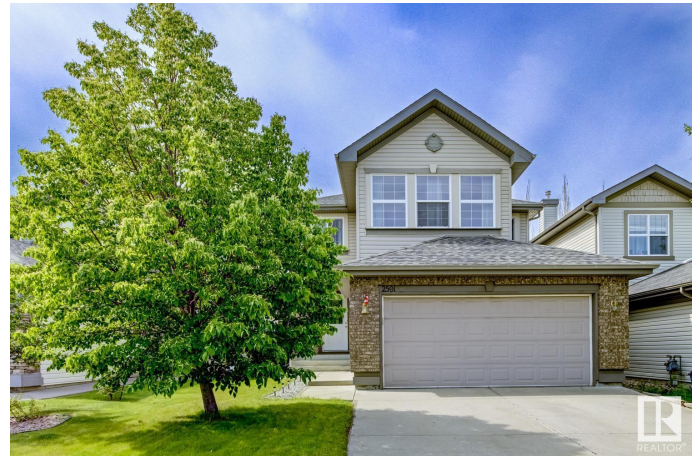
2591 Hanna Crescent NW