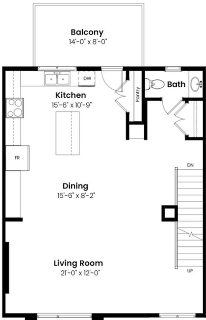
Main Floor: 832 Sq Ft